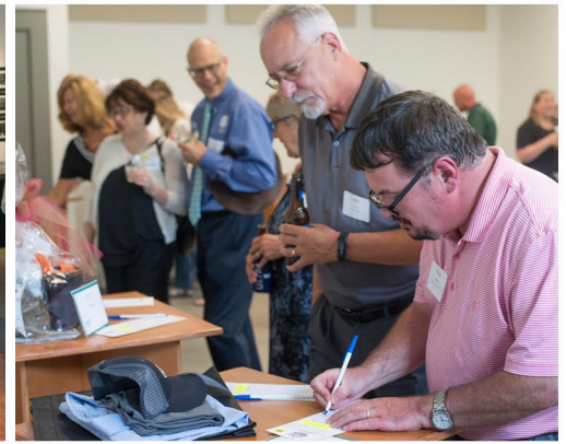
Scenes from the 2019 Auction & Dinner.

After such a long hiatus, I am excited to announce the 26 th Annual "Celebrate Athens" Auction and Dinner! Our Board of Directors, Staff, and Ambassadors look forward to hosting this year's event once again at the historic Dairy Barn Arts Center! We are keeping the overarching theme of "Celebrate Athens" to elevate the businesses and history who make our community so special. We hope you will join us!