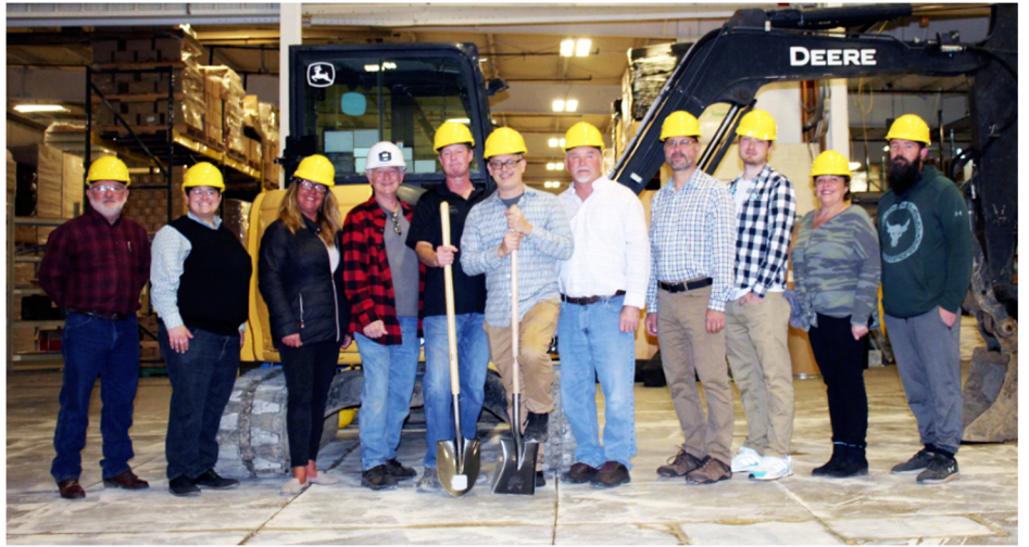
Milo's Whole World Gourmet staff, project leaders, and Chamber staff at the groundbreaking event on December 16, 2021.

Milo's Whole World Gourmet, LLC, is proud to announce a major $1 million facility expansion that will allow the company to dramatically increase its sales while significantly upgrading equipment. The company produces a portfolio of more than 40 specialty food products that range from pasta sauce to mustard to BBQ sauce to salad dressings, and the brand-new 2100-sq ft production facility, to be located inside the former Rocky Boots warehouse in Nelsonville, will include upgraded machinery and a connected Product Development/QC lab where the growing team of food technologists on staff get recipes ready for commercial production. The design and construction of the new facility used several Chamber member businesses, including the design by Jim Thomas of Chamber of BDT Architects , electrical work by Sun Electric , and the HVAC by Airclaws .